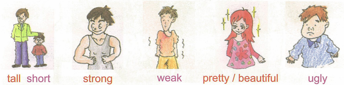
tall short strong weak pretty / beautiful ugly